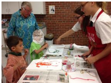
Pre K students "Paint Like Pollock" with some help from 7 th graders

More information can be found at: www.renaissance.com/products/assessment/star-360/